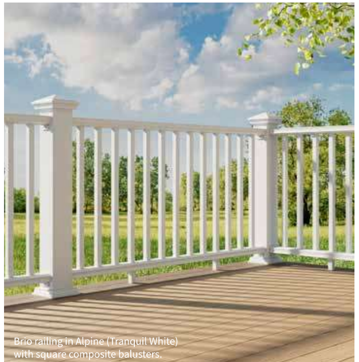
Brio railing in Alpine (Tranquil White) with square composite balusters.