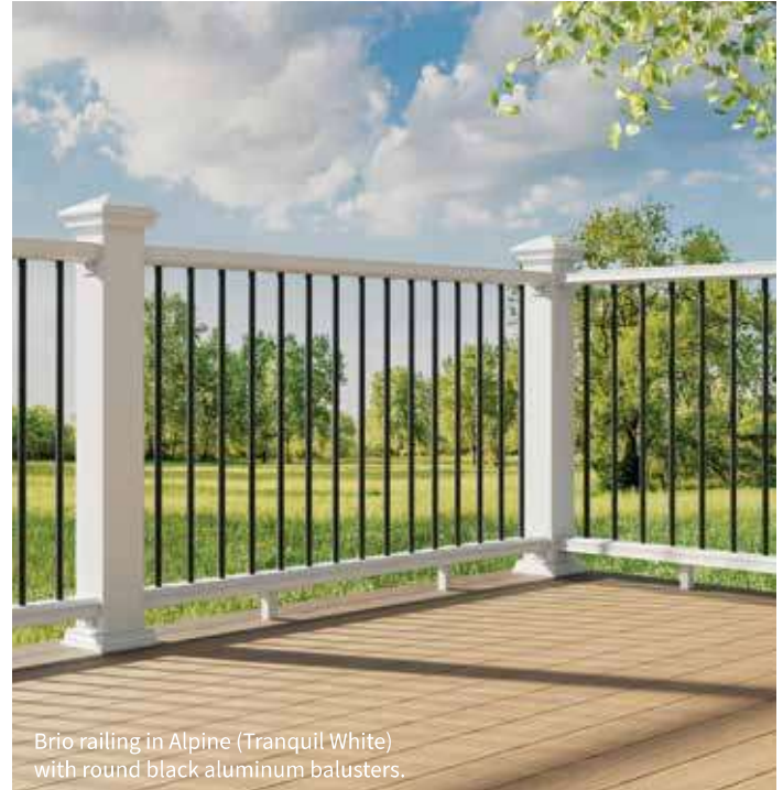
Brio railing in Alpine (Tranquil White) with round black aluminum balusters.

5 in. post sleeve kits are available which include post sleeve, cap and base moulding.